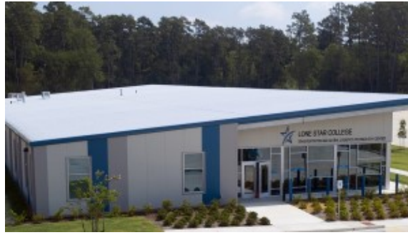
New Workforce Center of Excellence opened in June

The new, ultramodern 16,000-square-foot facility, located in Spring, features six classrooms, an 8.3-acre driving track with six backing pads and a truck driving simulator. It is an approved Texas Department of Public Safety Third Party Testing facility meaning students who complete Lone Star's commercial driver's license (CDL) program can also be tested at the facility.