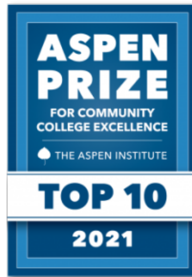
San Jacinto College receives

"This recognition is a testament to the resiliency and support of our community, our taxpayers, our businesses and industries, and our educational partners," said San Jacinto